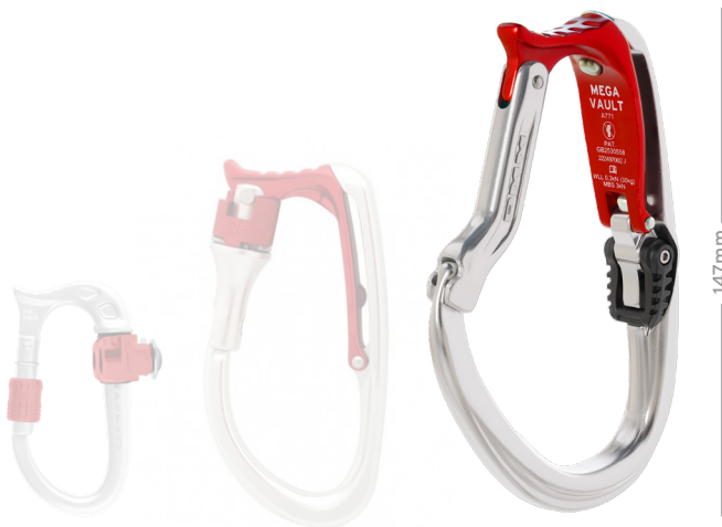
› Micro Vault