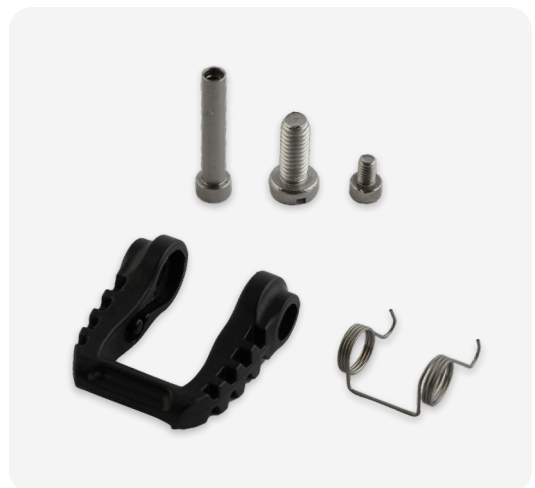
› Mega Vault Spares Kit